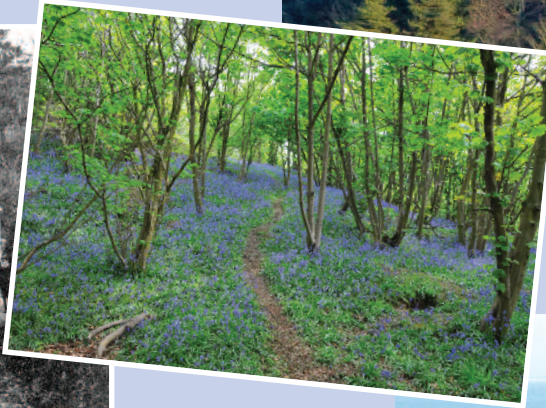
Left: A tranquil coppice in Hooks Wood where in March 1779 a famous battle between smugglers and Dragoons took place.