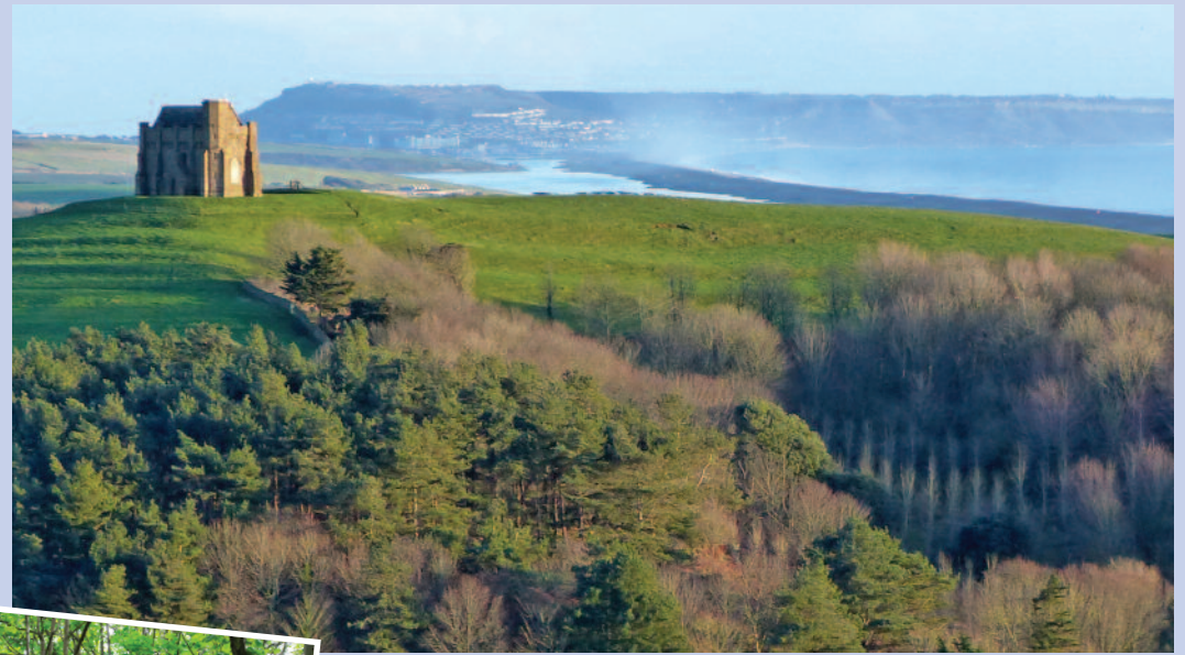
Above: The perfect lookout and signalling station of St Catherine's Chapel overlooks Fleet Lagoon and the smugglers' landing ground of Chesil Beach.