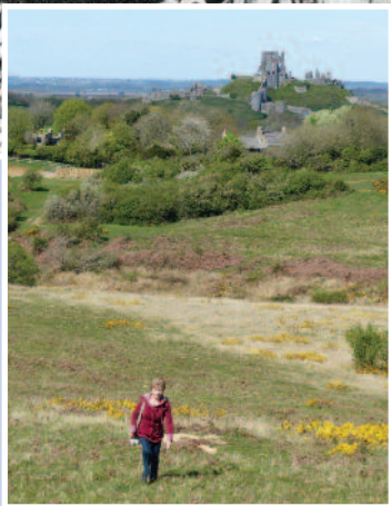
Eighteenth-century smugglers conveyed contraband such as fine French brandy and ladies' silk gloves across Corfe Common on their way from the Purbeck coast to London.